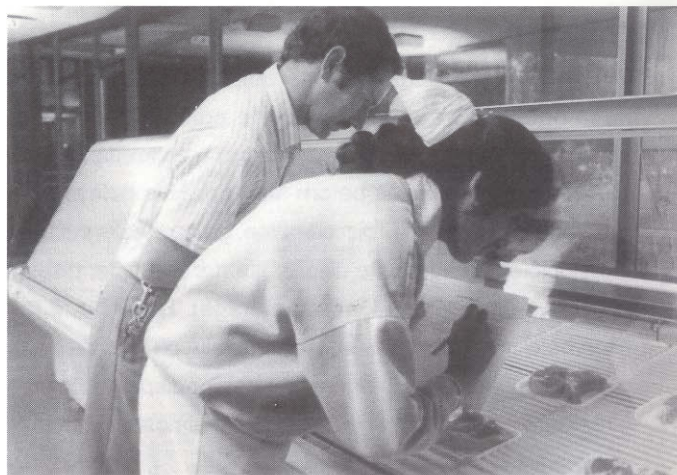
Scores by MIRINZ sensory panellists were a better measure of fat greyness than instrumental readings.

Even when drip was excluded from the fat, if the fat had been stained with blood during carcass dressing, enough